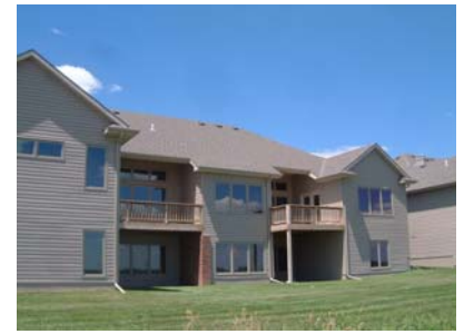
Large Deck – Daylight Windows